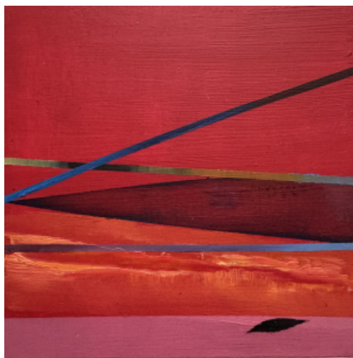
Philippa Tunstill Cross Purposes Oil on board 15x15cm

This is an exciting exhibition of 50 London Group Members. Diverse media are embraced which include drawing, ceramics, collage, mixed media, painting, printmaking, sculpture and video. There is no theme to the exhibition, but a condition is that all works can be no bigger than 30x30cm 2 .