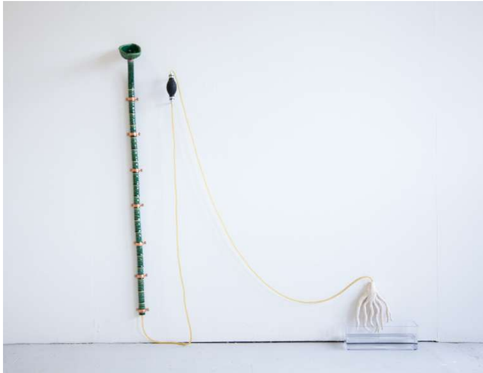
Emilia Gonzalez, Lean in Press Me Breathe , clay, distilled scent, medical rubber pump system, 150 x 150cm