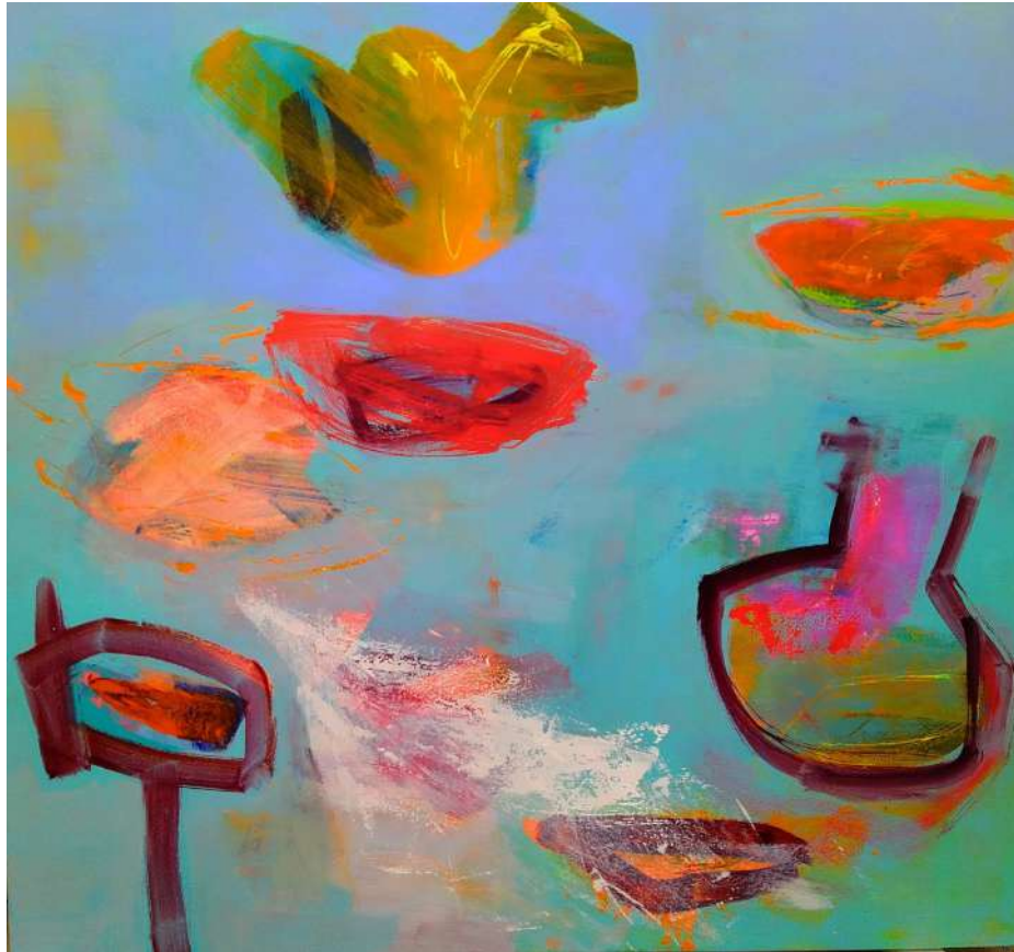
Niamh Collins, Sugar Rush , oil painting, 88 x 94 cm