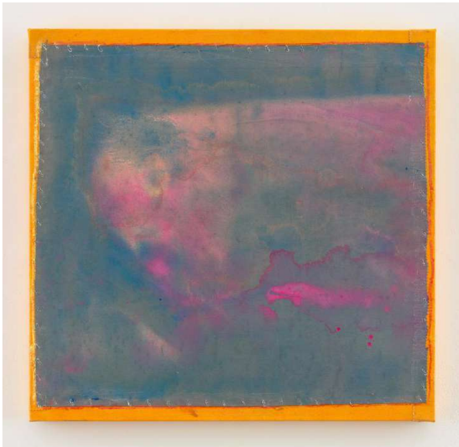
Frank Bowling, Pious , 2020, Acrylic on canvas with canvas marouflage, 71.6 x 74.3 cm, © Frank Bowling. All Rights Reserved, DACS/Artimage 2023.

The London Group , the oldest and most esteemed artists' collective, will open the doors of its 85 th Open exhibition from Friday 10 November to Sunday 26 November 2023 , at Copeland Gallery in London, with the Private View taking place on Thursday 9 November.