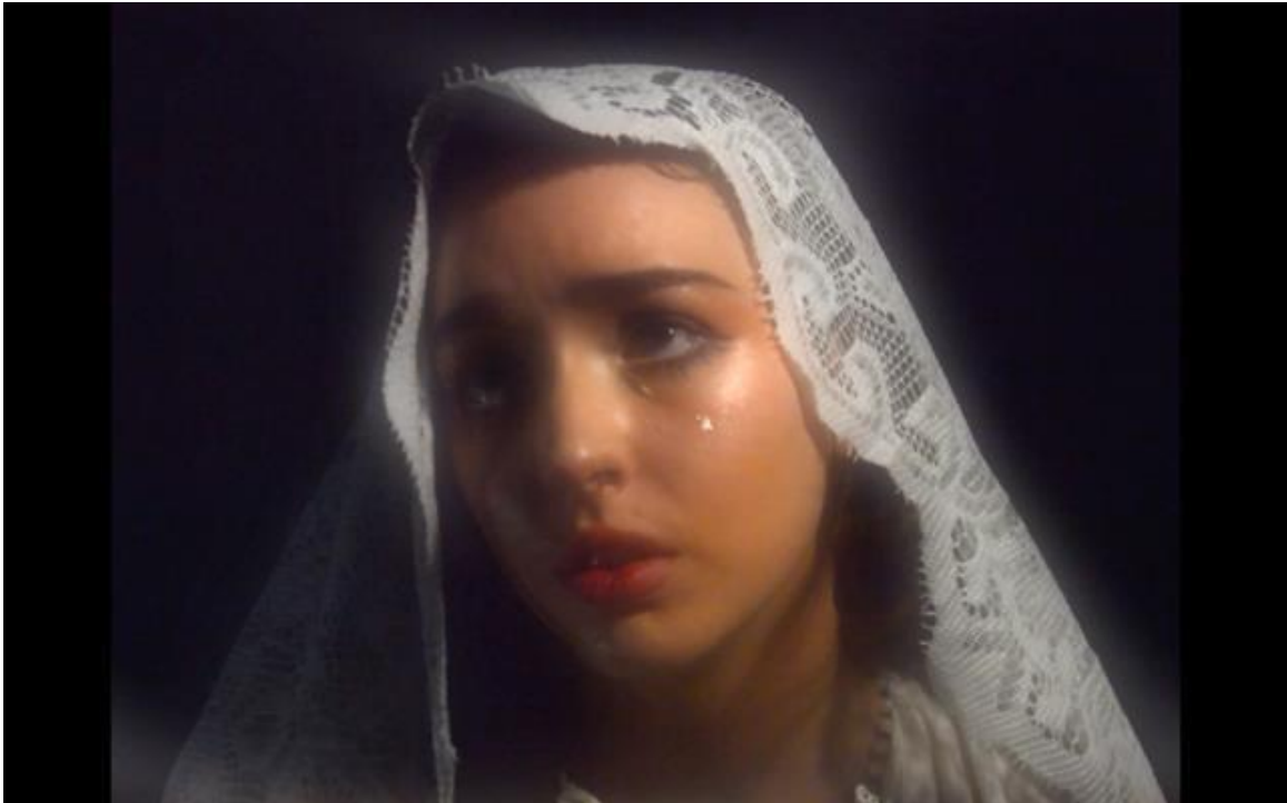
Ciana Taylor, Sex Education for Girls , Moving Image Installation, 8m 55s