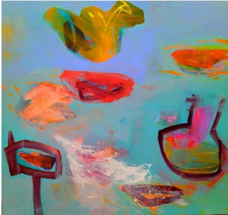
Niamh Collins, Sugar Rush , oil painting, 88 x 94 cm

The following prizes were awarded to outstanding non-member artworks in the exhibition: