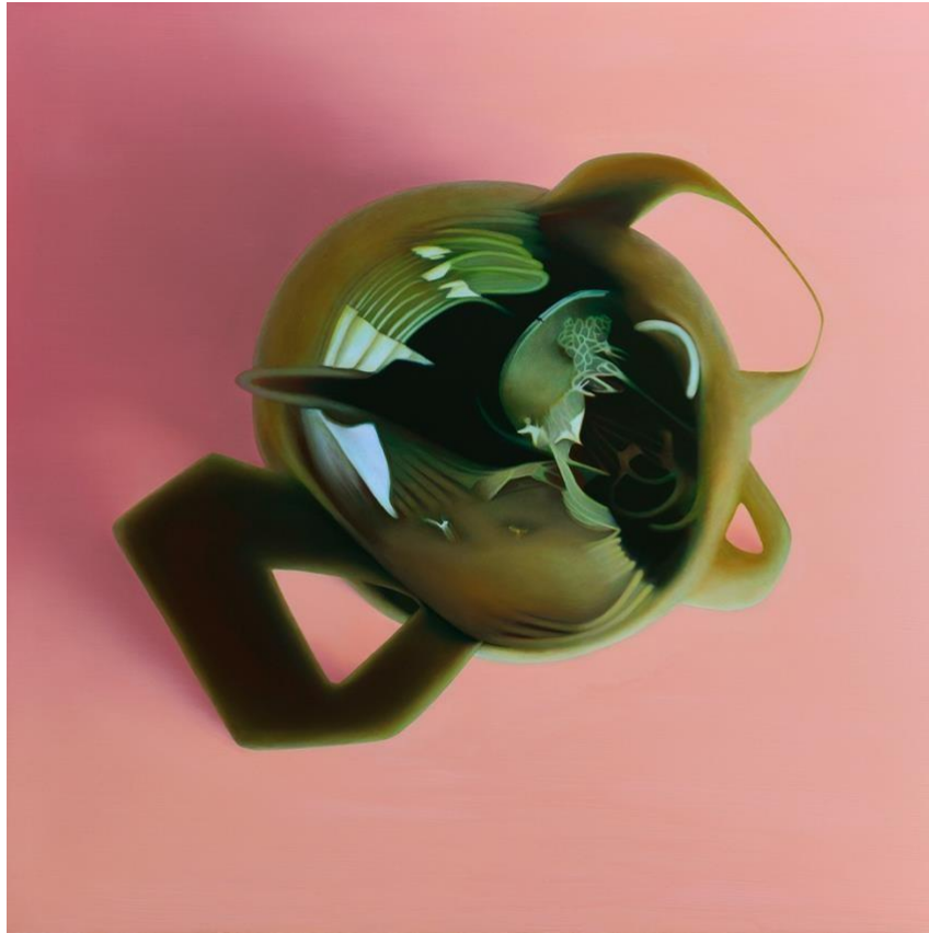
Lesley Bunch, Shadow Sculpture 29 , Oil on Wooden Panel, 50 x 50cm

The London Group prides itself on supporting artists and providing a platform for contemporary practice and discourse. Since its establishment in 1913, the Group has nurtured the careers of some of Britain's most renowned artists. Today, the Group continues to pave the way with distinguished opportunities for artists, including the 85 th Open Exhibition and the prizes awarded.