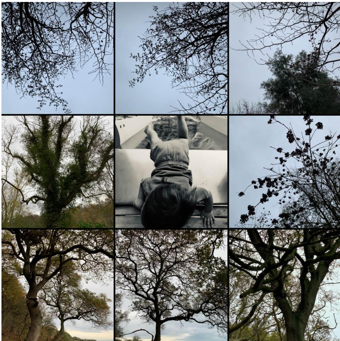
Marenka Gabeler LG Hanging in there Photography