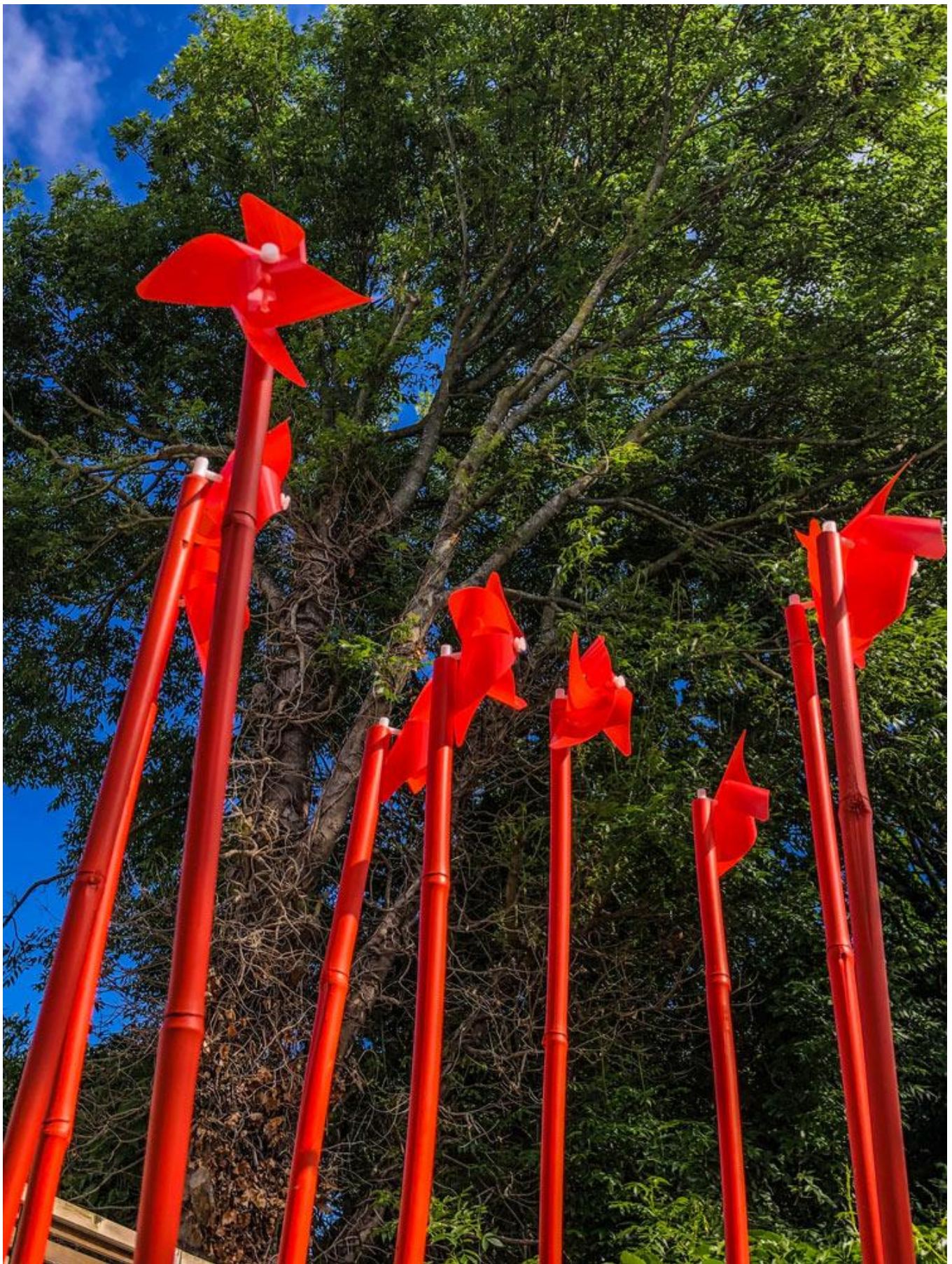
Paul Bonomini LG Catch Your Breath Bamboo canes and plastic foil