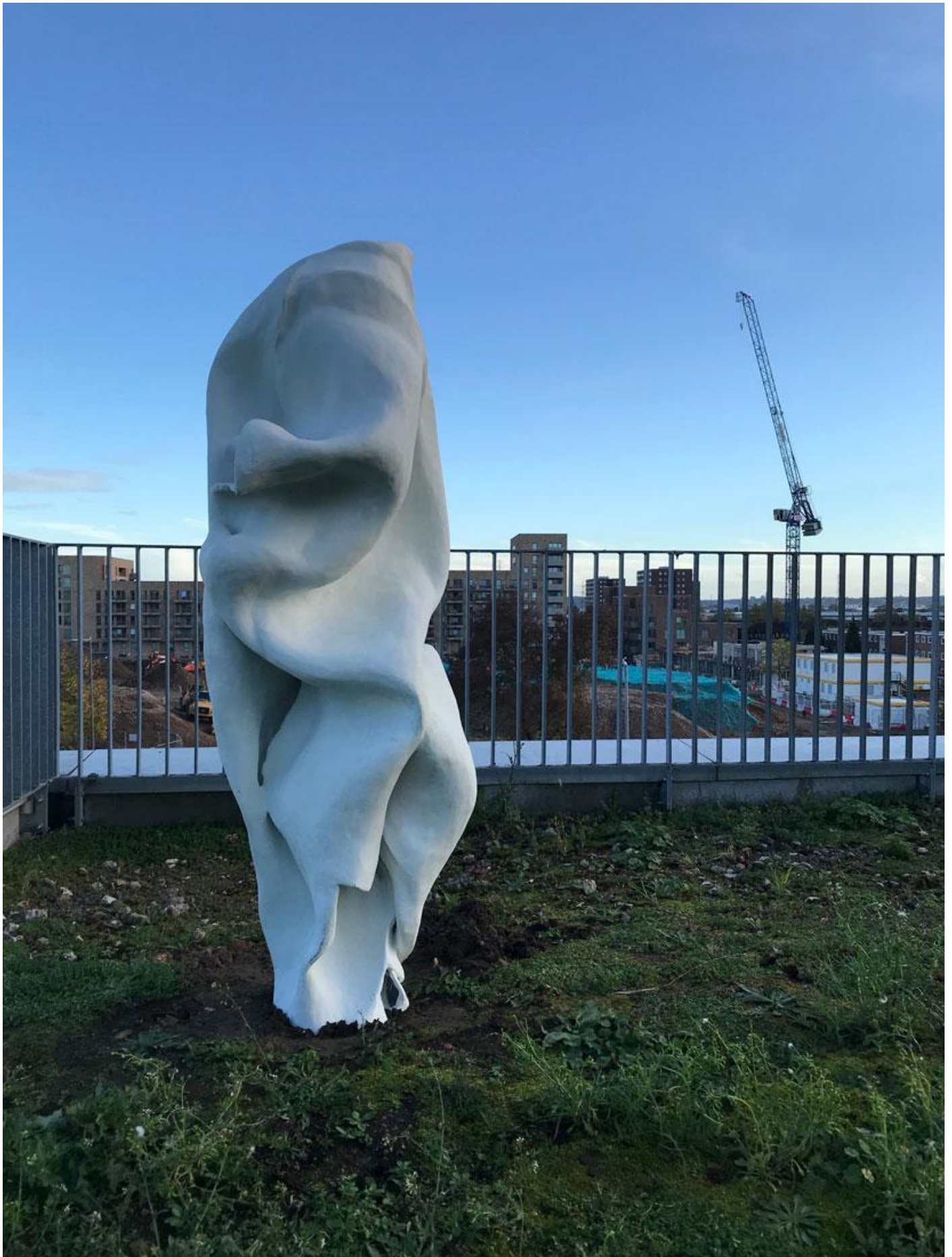
Christopher Simpson The Graces Wood, Aluminium, cement