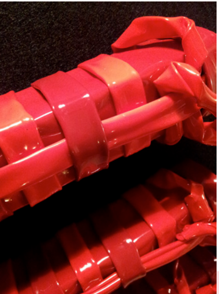
Tommy Seaward, Prelude (095)