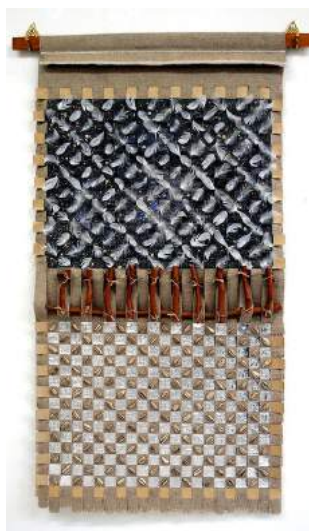
David Redfern 'Tānes First Light'