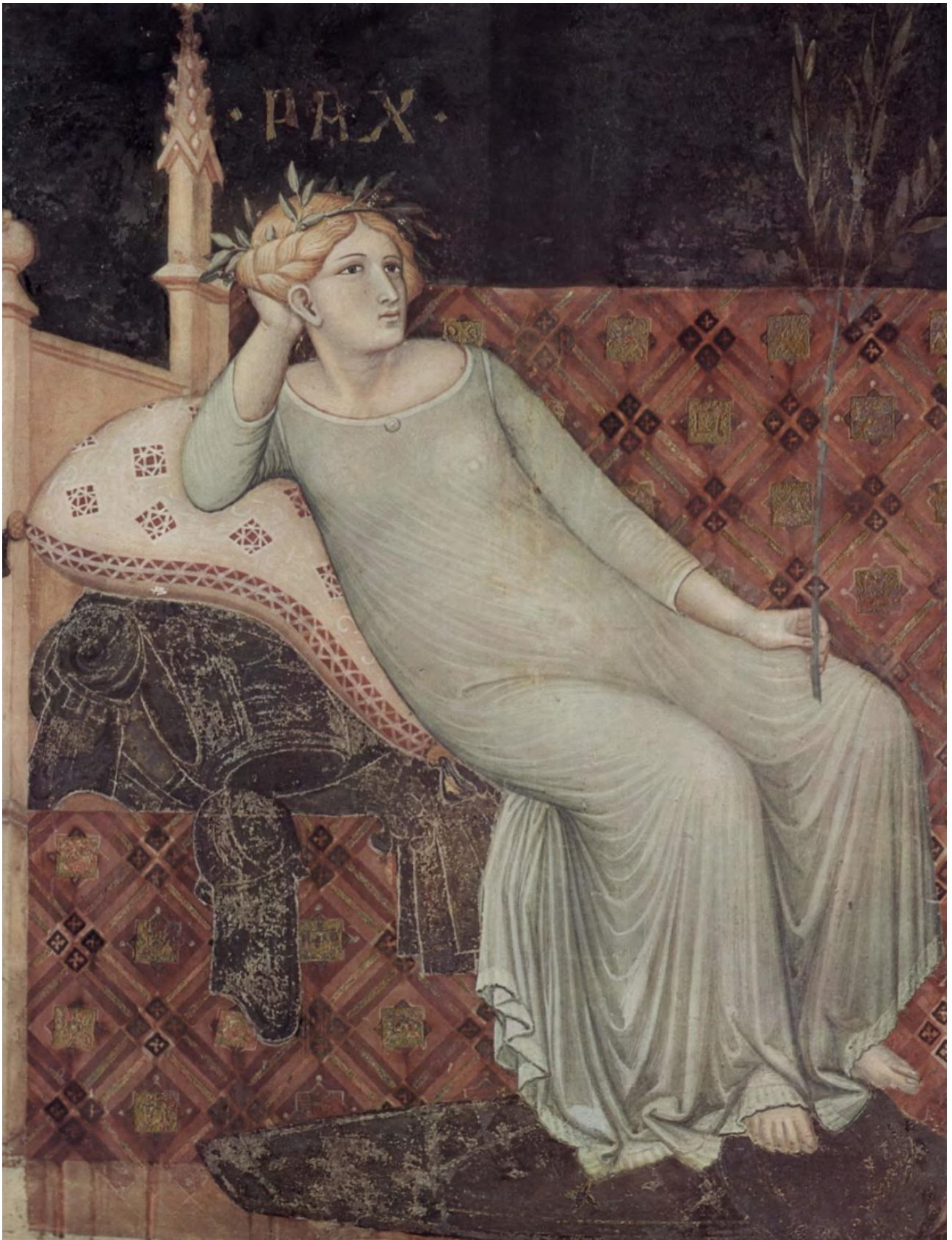
Ambrogio Lorenzetti PAX detail from The Well Governed City fresco in Palazzo Pubblico Siena 1349