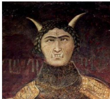
The Tyrant detail from The Badly Governed City fresco in Palazzo Publico Siena 1349