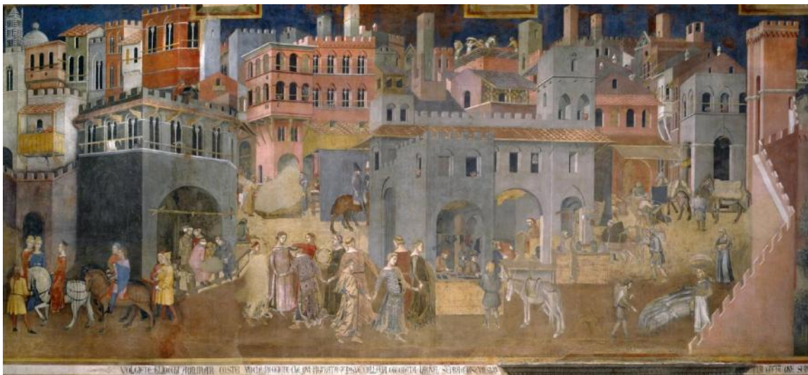
Detail from The Well Governed City fresco in Palazzo Publico Siena 1349