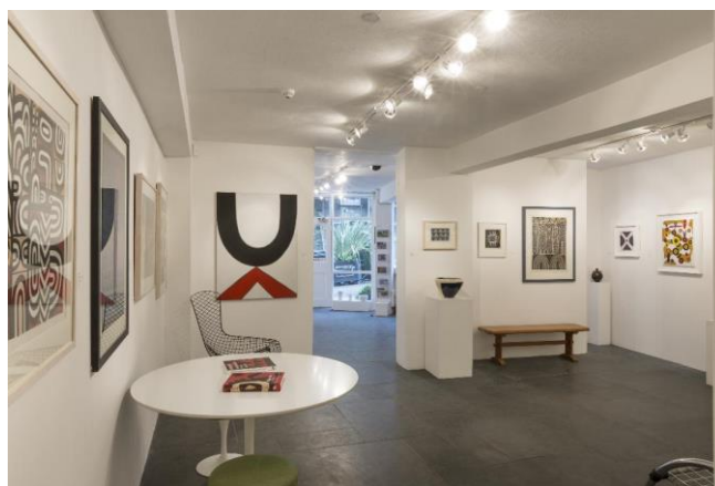
Belgrave St Ives