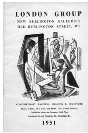
London Group archive at TATE