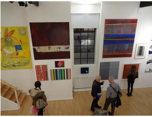
Cello Factory, London